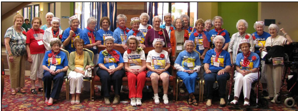
What a lovely group of Rosies at the Phoenix Convention 2012!!